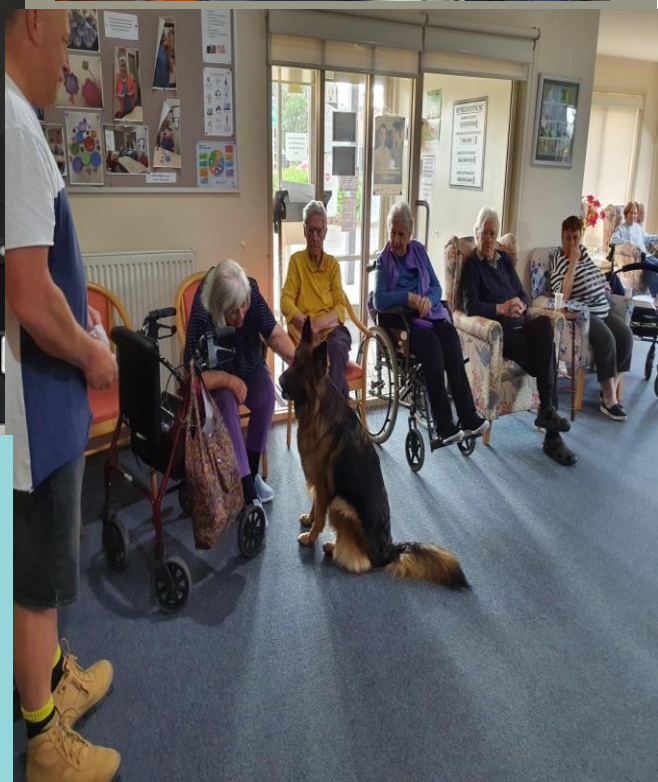
Residents enjoyed visits from one of the family pets.